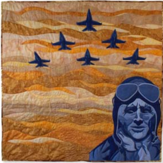
Cena Harmon Pensacola, FL